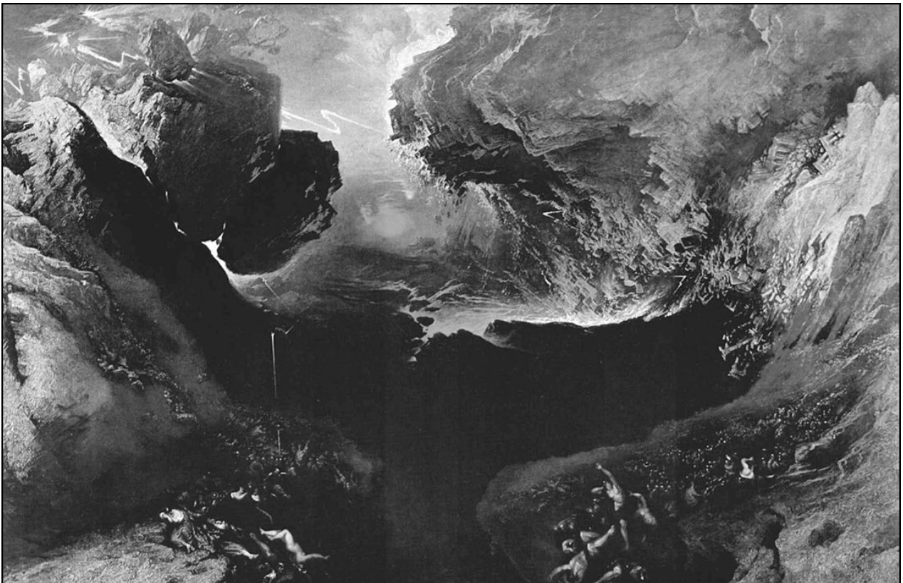
'The Great Day of His Wrath', by John Martin c 1853

At this point in the narration a significant word is first introduced which I will continue to explore. The 'invasion' comes in the form of the first appearance of Morwyn's father who 'invades' the harmonious trio of Morwyn, the narrator and Black Peter on a solitary shared walk 17 . Morwyn has an affection for her father even though he is "a tremendous vivisector"—admittedly a perfunctory characterization! This dimension of the father's character creates a rift with his daughter and shocks the narrator as he recognizes "a gloating response to some kind of horrible cruelty": Black Peter himself reacts against the father's visualizing of "effective straps" used to restrain an animal victim .