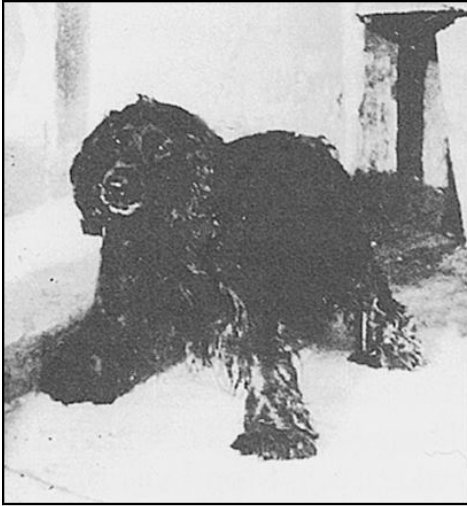
Black Peter

However the visionary and imaginative levels of experience do not abolish the level of reality for those who live in a physical universe still existing within the only partially realized salvation of the ultimate evolution of the System-of-Things to pity and mercy. The Captain/narrator is still brought to a Lemuel Gulliver-like state of bitter disillusion in a process that involves the stripping from him of all visible comforts.