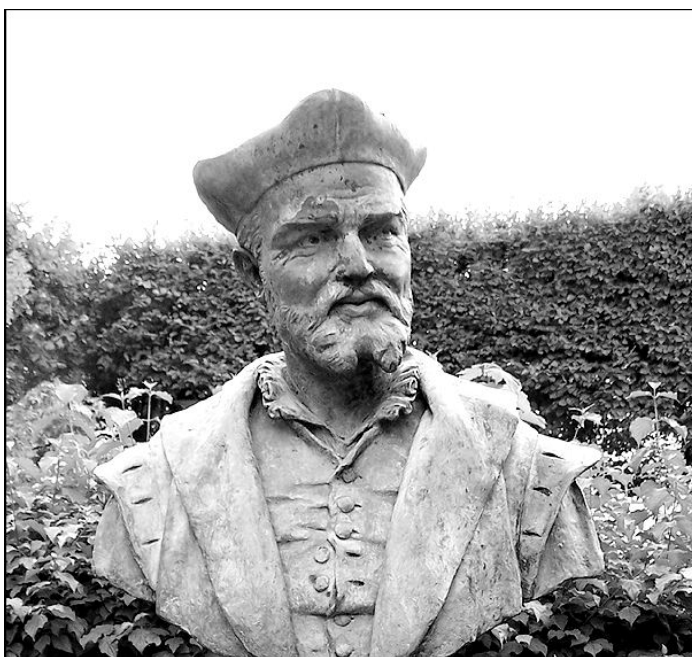
François Rabelais from Wikimedia Commons

then sheds his Tear. The Tear of Tityos supports the possibility for the System-of-Things to be bent upon goodness and mercy. These are realities that can be and are expressed in action and therefore go beyond both Faith and Doubt. We can feel pity and we can act to prevent and relieve suffering—as Socrates and Rabelais do for the Captain. That Tityos sheds a tear is meant as testimony that the cry of the world in suffering is not disregarded. If torment is recognized and its cry heard there is room for hope that the System-of-Things is on the side of pity and hope.